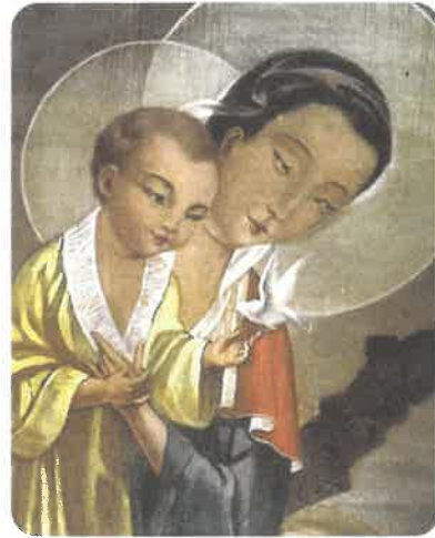
VIRGIN AND CHILD, ASIA (ARTIST UNKNOWN)

Recall, too, that Jesus and his disciples spoke Aramaic, and there is no equivalent for the meaning of "cousins" as we know it in that language. Instead, the word for brother or sister was used when referring to cousins. Thus, when St. Jerome ( circa 340-420) translated the Bible from Hebrew into Church Latin, he considered "the brothers of Jesus" as cousins, not siblings. After all, it would have been the rightful responsibility of these male relatives of Jesus to take care of Mary when Jesus died. Yet Jesus entrusts his mother to the care of his beloved disciple John (John 19:26). ●